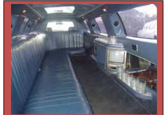
Plain vs. Fancy